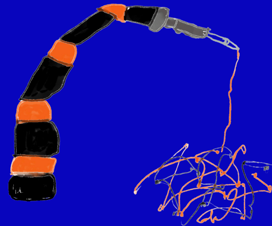
IGUS REBEL COBOT